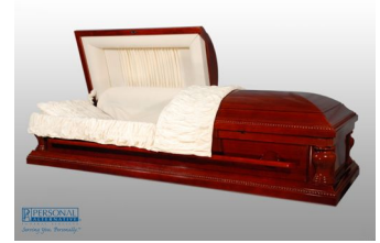
Liberty add $1099