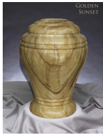
Sunset Add $199