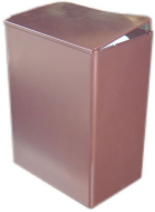
A Plastic Urn Add $10