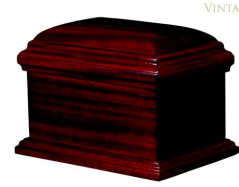
Vintage Add $329