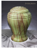
Evergreen Add $199