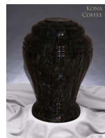
Kona Coffee Add $199