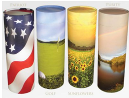
4 Options: Flag, Golf, Sunflower & Pond Add $119